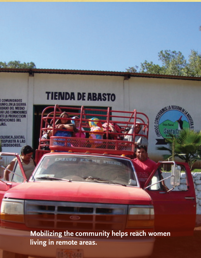
Mobilizing the community helps reach women living in remote areas.

When we started to work here a few years ago, communicating to women that they needed to get screened was an enormous challenge, and we had problems with the husbands, who didn't want to let their wives have the exam.