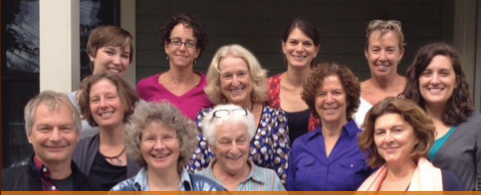
A team from the WHO joined Grounds for Health to revise guidelines on cervical cancer prevention.

An important part of Grounds for Health's work is sharing what we've learned with the global health community. With 16 years experience working in coffee-growing communities, Grounds for Health has unique insight into what makes programs effective and sustainable. The global health community has embraced our message with open arms.