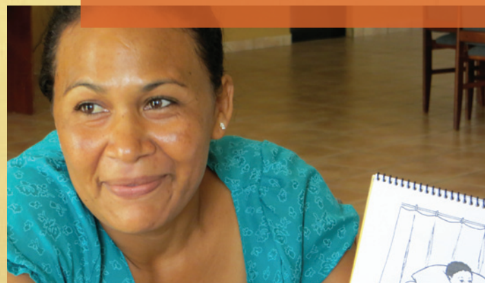
A community health promoter gives a talk on cervical cancer screening using the new training curriculum.

Grounds for Health has trained 500 Community Health Promoters.