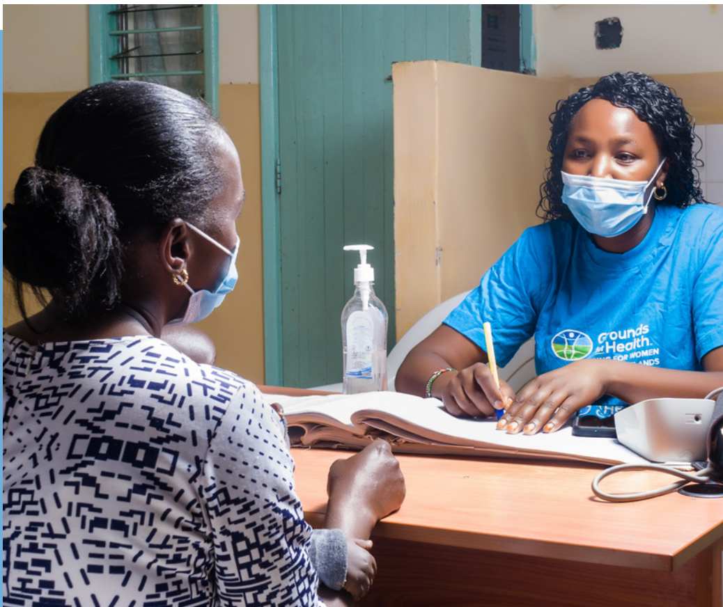
Consultation during a special mini campaign to mark World Cancer Day, February 4 2022.